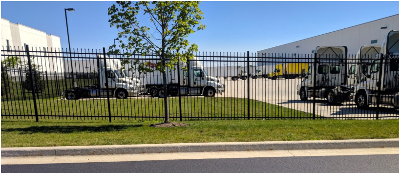
Previous fencing offered no sound mitigation.